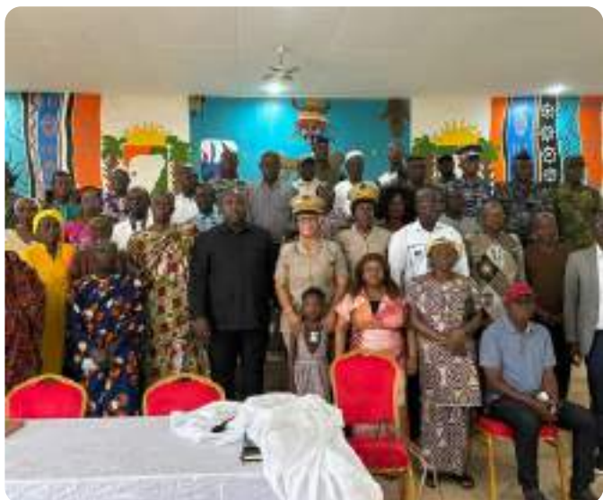
Mediator of Ivory Coast (an OICOA Member Institution) held an awareness session in Bingerville region to promote the role of Mediator's office in holding peaceful and democratic Presidential Elections