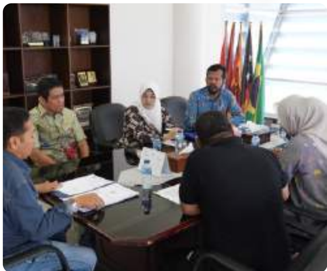
Delegation of Indonesian Ombudsman paid a working visit to Sabang Free Trade Zone Authority to discuss avenues for supporting investment and tourism in the region