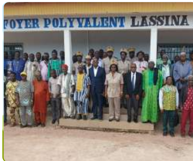
Delegation of Mediator of Ivory Coast (held an awareness session in Hambol region for Violence free and peaceful upcoming Presidential Elections