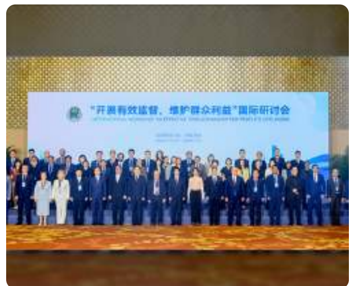
Group Photo of the participants at the International Workshop on ‘Effective Ombudsmanship for People’s Livelihood’ held under the banner of Asian Ombudsman Association at Beijing