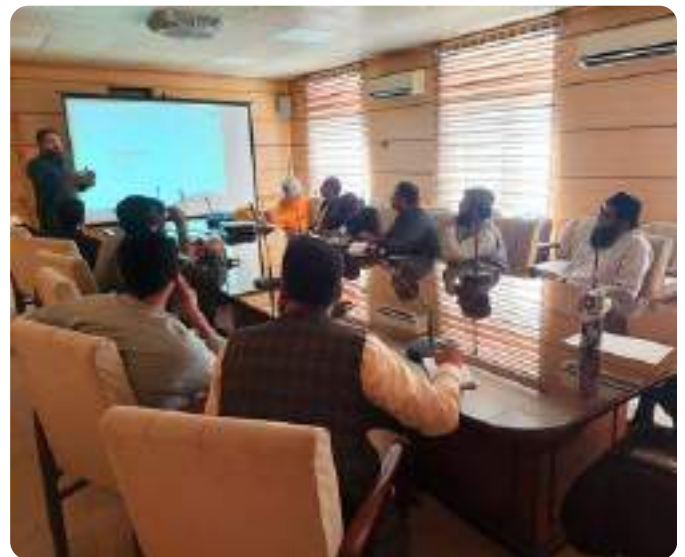
Provincial Ombudsman of Balochistan conducts a specialized IT program training session for capacity building of its staff for effective complaint management and resolution