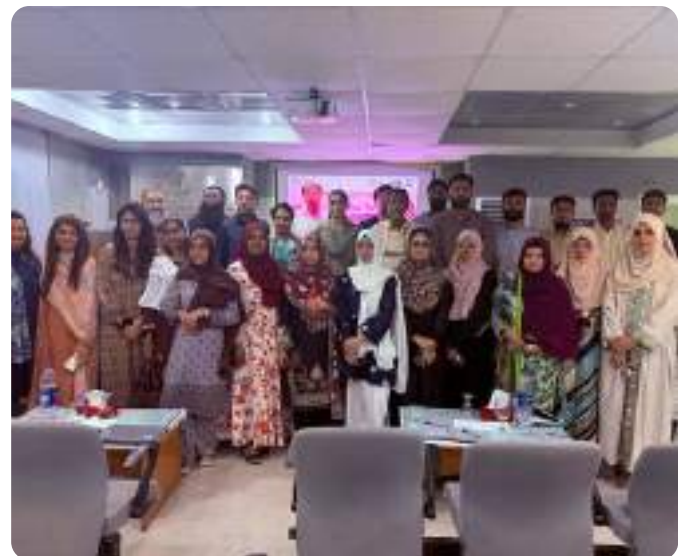
FOSPAH (Karachi Regional Office) holds GenderTalks Session on "Importance of Grievance Mechanisms for Harmonious Industrial Relations", hosted at Towel Manufacturers Association