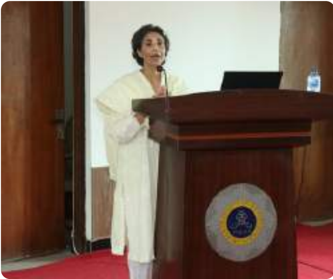
Pakistan's Federal Ombudsperson for Protection Against Harassment H.E. Fauzia Viqar delivers a lecture on Workplace Harassment Act 2010 at the National Highway and Motorway Police Training College