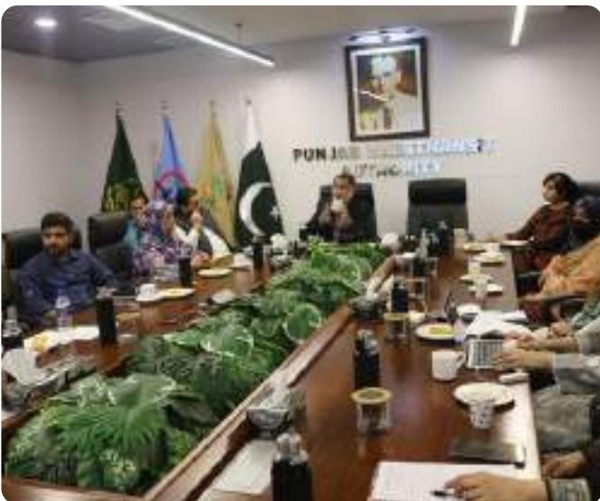
FOSPAH holds an Awareness Session regarding Safety Against Workplace Harassment at the HeadQuarters of Punjab Mass Transit Authority