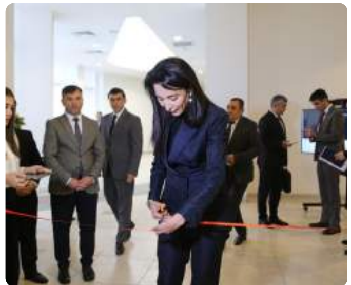
OICOA Board Member and Human Rights Commissioner of Azerbaijan H.E. Sabina Aliyeva inaugurates the North-West Regional Center of the Ombudsman in Shaki Region