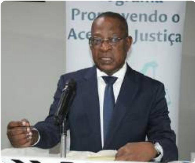
OICOA Member and Ombudsman of Mozambique H.E. Isaque Chande addresses the Roundtable on ‘Challenges and Opportunities for Promotion of Human Rights in the Context of Conflict’