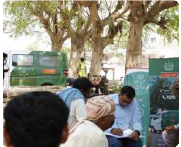
‘Awami Khidmat Van’ of Provincial Ombudsman of Punjab visits Lodhran District to hear complaints of the citizens at their doorstep