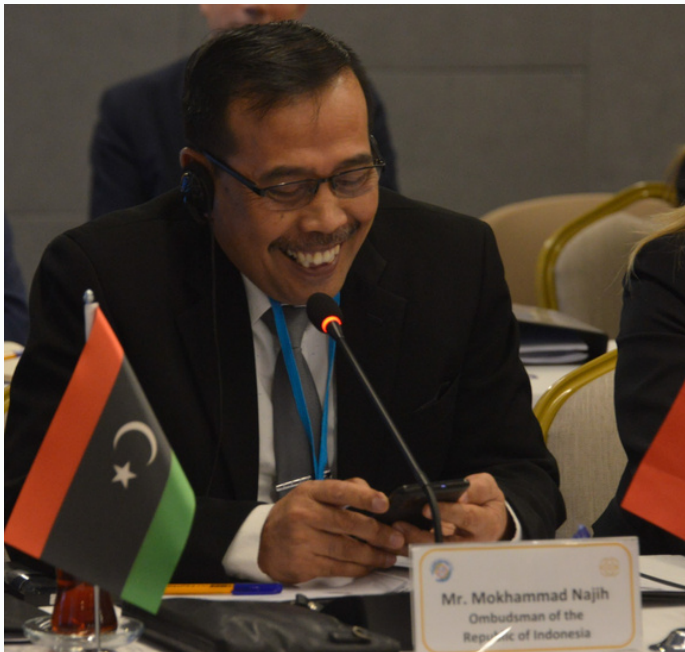
Mr. Muhammad Najih, Ombudsman of Republic of Indonesia participates in OICOA General Assembly Session