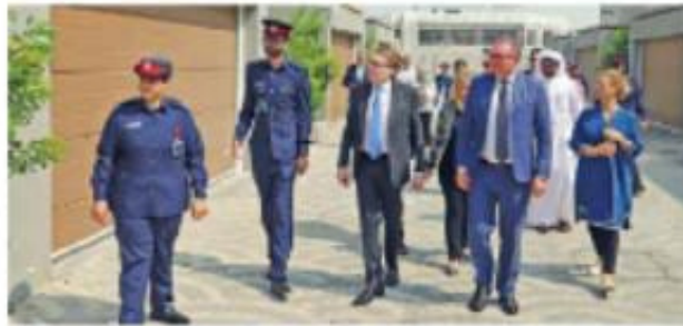
Canadian Justice Minister Aron Fontana, Ombudsman Ghada Habib, and other officials visiting the facility

Highlighting the efforts of the Bahraini leadership and Ministry of the Interior, Ombudsman