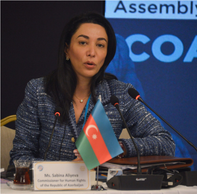
Ms. Sabina Aliyeva , Commissioner for Human Rights of the Republic of Azerbaijan participates in OICOA General Assembly Session

NOV 2023, VOLUME-I, ISSUE-III NEWSLETTER